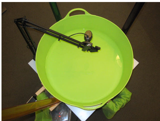
Figure 2: Top-down view of the installation

Apart from the sound generated directly by the scanned synthesis, an additional aspect of the sound design for this installation was the concurrent playback of samples of tuned plastic tubes being struck. The percussive nature of this sound counterbalanced the more continuous nature of the scanned synthesis, resulting in a more pleasing musical texture. The frequency and intensity of these percussive strikes were modulated by the amount of activity in the water, as represented by the summed amplitude envelopes of the scanned waveforms.