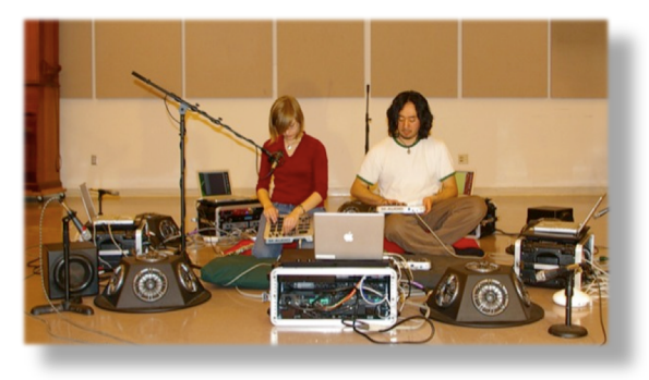
PBS 1.0 in 2007

E-mail contact: fiebrink@princeton.edu Year of composition: 2009 Estimated duration of performance: 25 minutes (can be adjusted)