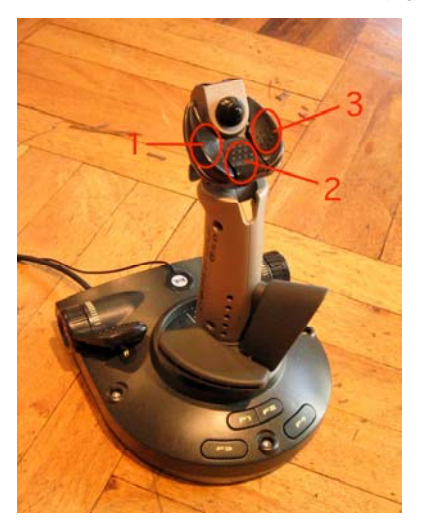
Figure 3: The Saitek Cyborg 3D joystick has 13 buttons and 4 continuous controllers. The three buttons on the top, labeled 1 to 3, can be used to route the continuous controller values to different destinations.

Finally, we promote the use of OSC for designing controller data streams that are modal . For example, the Saitek Cyborg 3D joystick provides an extremely flexible controller due to the number of buttons it has accessible to the performer in conjunction with its 4 continuous controllers (figure 3).