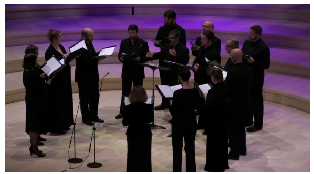
Cappella Romana concert, February 1st, 2013

performances involving artificial reverberation, the virtual Hagia Sophia created in the Bing Concert Hall "responded in a very natural way," and felt like a "real space," "holding its pitch" and allowing control over the harmonic content of the ison (drone).