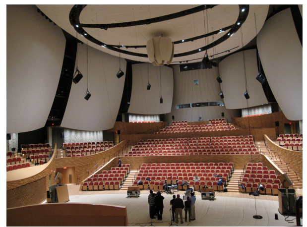
Rehearsal, chanters from the Holy Cross Church

In December 2012 we had the opportunity to do a more complete test of the whole diffusion system in the framework of a two-day complete technical rehearsal in the Bing Concert Hall. It was the first time we had access to the Hall, and we installed a complete rigging of our 24.4 system in a full 3D dome.